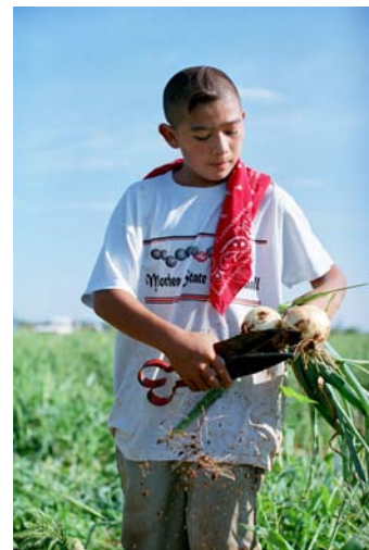
Young American migrant worker harvesting onions, Eagle Pass, Texas, 2003.