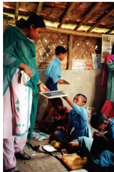
A student hands their chalkboard to a teacher at the Pudar School for Street Children, 2000.

◆ The Connecticut Coalition for Human Rights is hosting Fulfilling the Promise of Human Rights: the Universal Declaration at 60 , a statewide conference marking the 60th anniversary of the UDHR on Saturday, Dec 6th from 8:30-4pm at Quinnipiac University in Hamden, CT. Please see attached flier or visit www.udhr.net for more information.