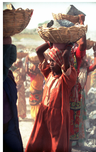
All day, girls fill and empty heavy baskets of rock in Orissa, India, 2000.