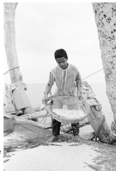
A boy sifts teri on a jermal in the waters off Northern Sumatra, Indonesia, 1999.