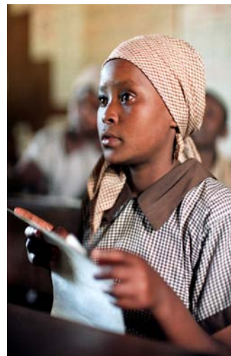
An AIDS orphan attending a special class in the Ngegu Primary School outside Nairobi, Kenya, 2002.