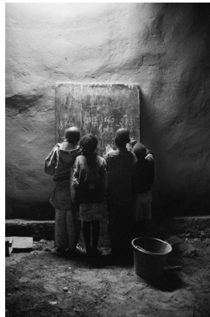
Underneath a street lamp, children study math in Si- kasso, Mali, late at night, 2006.

War is Death - Dow Field at 12PM "The Price is Right!" War Edition - Dow Field at 1PM Iraq Veterans against the War: Panel Discussion - Dodd Center at 4PM Funk the War 2! - Outside the Dodd Center at 6PM