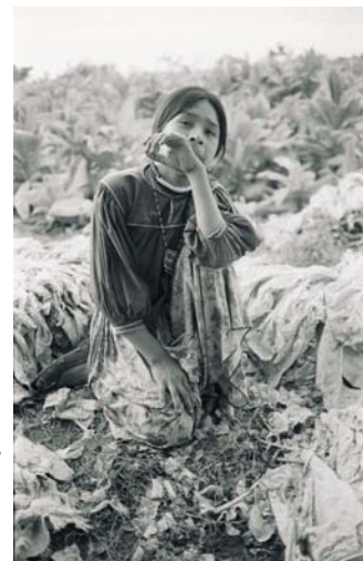
A Huichole girl threads strings of tobacco, 2002. Photo from Robin Romano's Stolen Childhoods Series