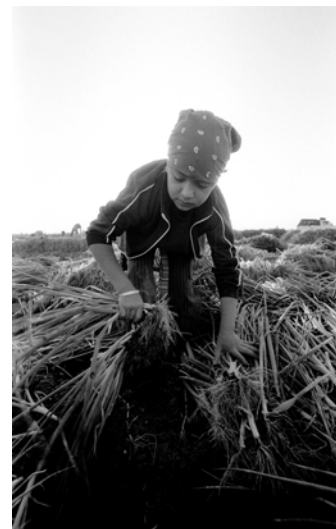
Migrant children harvest onions in Mexicali, Mexico, 2001.