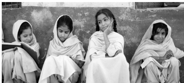
Rugmark School for Girls, Lahore, Pakistan, 2000.