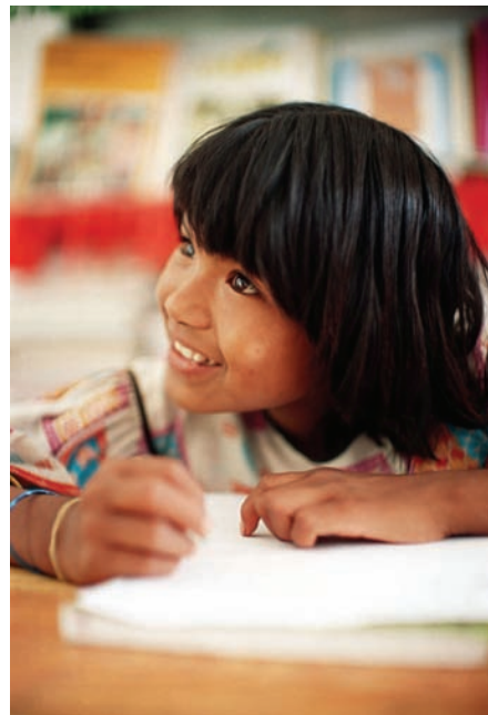
A Huichole girl, a migrant tobacco laborer, takes advantage of the opportunity to learn at a Florencia school in Nayarit, Mexico.